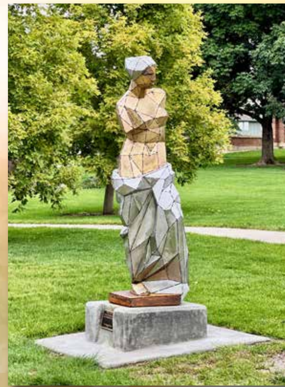
Venus by Bruce Gueswel

In January 2024, the Loveland High Plains Arts Council (LHPAC) presented five sculptures to be donated and placed in Benson Sculpture Garden, marking the 39th year of gracious donations to the public art collection. The artworks were dedicated in the summer of 2024.