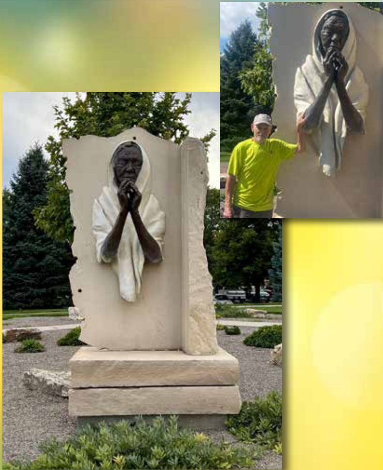
Trail of Forgiveness by Denny Haskew

Trail of Forgiveness is another generous donation made by the Council of Catholic Women in the fall of 2023. This sculpture was installed at the Police & Courts Building in September 2024.