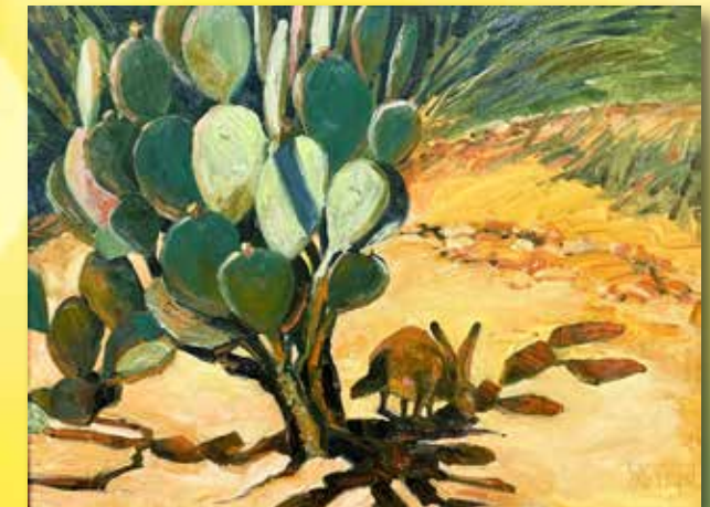
Jack Rabbit Buffet