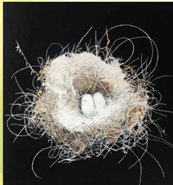
Nest Rayito by Elaine St. Louis

Nest Rayito was purchased during the Governor's Invitational Show and Sale at the Loveland Museum in the spring of 2024.