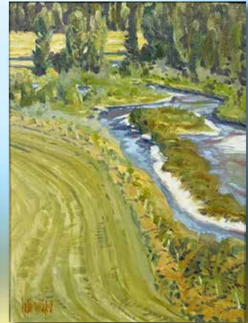
Fish Creek by Hollis Williford

Loveland Art in Public Places purchased four oil paintings by Hollis Williford from a private collector. These paintings will be on display in City buildings in 2025.