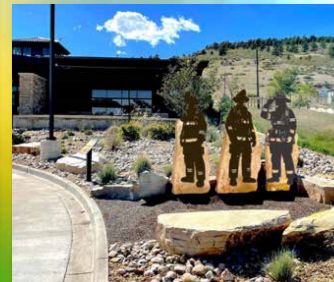
Fire Station 7 Artwork by James Lynxwiler (Conceptual Drawing)

Fire Stations 7 and 10 Sculptures: Two local sculptors were awarded commissions for Fire Stations 7 and 10 for the Loveland Fire and Rescue Authority. The artists are in the fabrication stages of their respective projects.