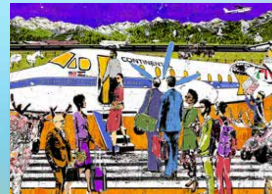
Where Do You Want to Go by Daryl Thetford

Northern Colorado Regional Airport: Suspended Artwork. Three artists were selected in late 2024 to present design concepts for the passenger waiting area in the new terminal. The selected artwork was chosen in the winter of 2025 and is planned for installation in late fall.