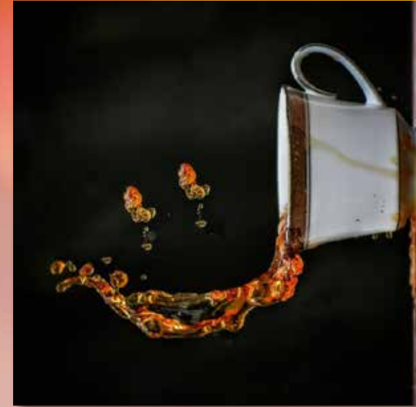
Smile! by Desiree K Luca