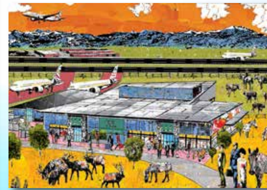
To Build A Better Airport by Daryl Thetford

Northern Colorado Regional Airport: Daryl Thetford Murals. Artist Daryl Thetford was selected to create four large-scale murals near the security area in the new airport terminal. These colorful and playful depictions of aviation and local sites create memorable visions of the front range. Installation is expected late summer 2025.