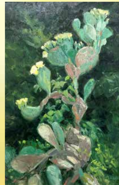
Cactus by Hollis Williford

Loveland Art in Public Places purchased four oil paintings by Hollis Williford from a private collector. These paintings will be on display in City buildings in 2025.