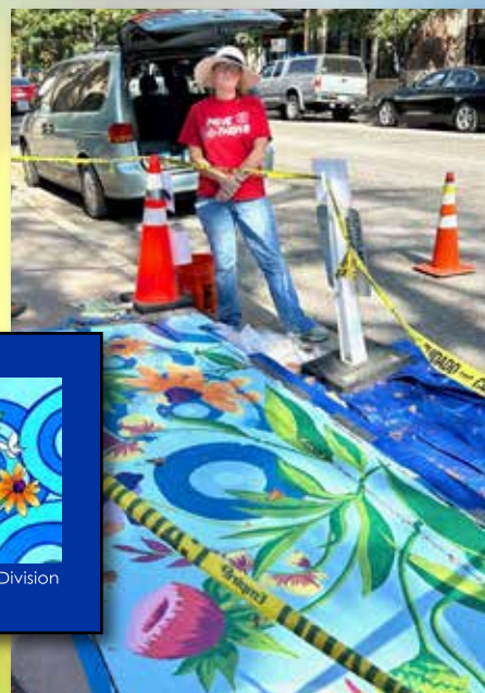
Ripple Effect by Amelia Furman

Northern Colorado Regional Airport: Daryl Thetford Murals. Artist Daryl Thetford was selected to create four large-scale murals near the security area in the new airport terminal. These colorful and playful depictions of aviation and local sites create memorable visions of the front range. Installation is expected late summer 2025.