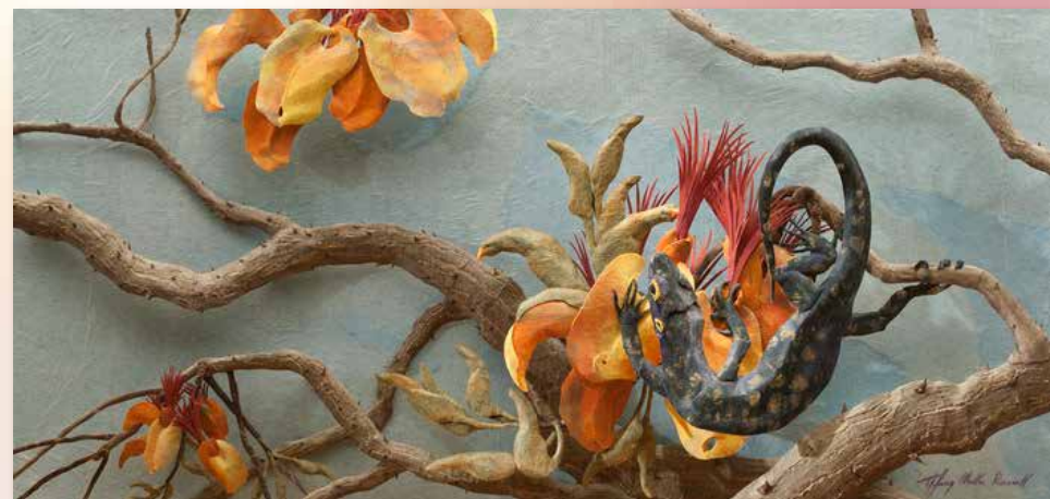
Sweet Oasis by Tiffany Miller Russell

TAAP 3D sculptures were de-installed from the 4th Street display in anticipation of the 2025-2026 HIP Streets renovation project. We look forward to continuing this project in 2027.