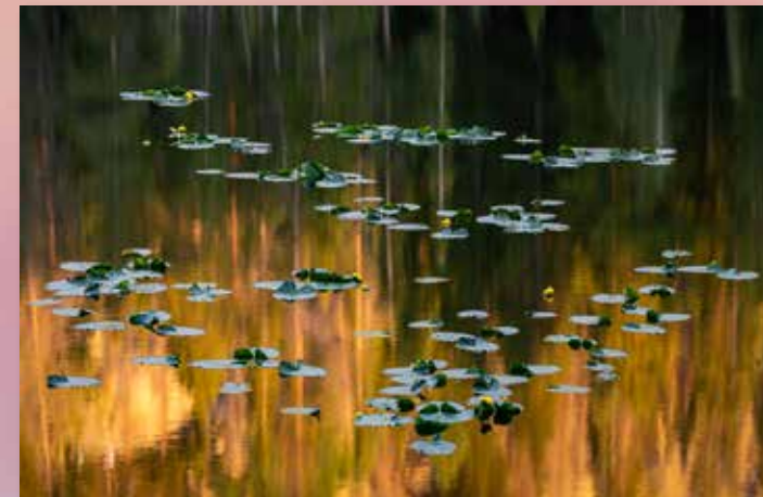
RMNP Nymph Lake