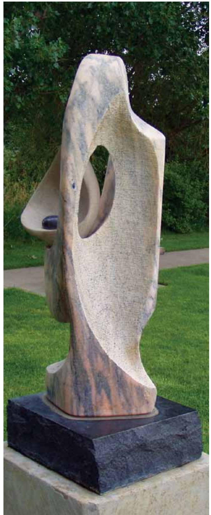
Cradle Your Dreams by Vanessa Clarke

VAC prior to the second and final reading regarding the proposed installation. Under some circumstances, second reading may be waived.